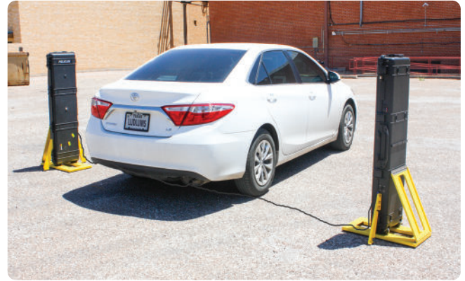
Use as a vehicle monitor (above) or as a personnel monitor (below)